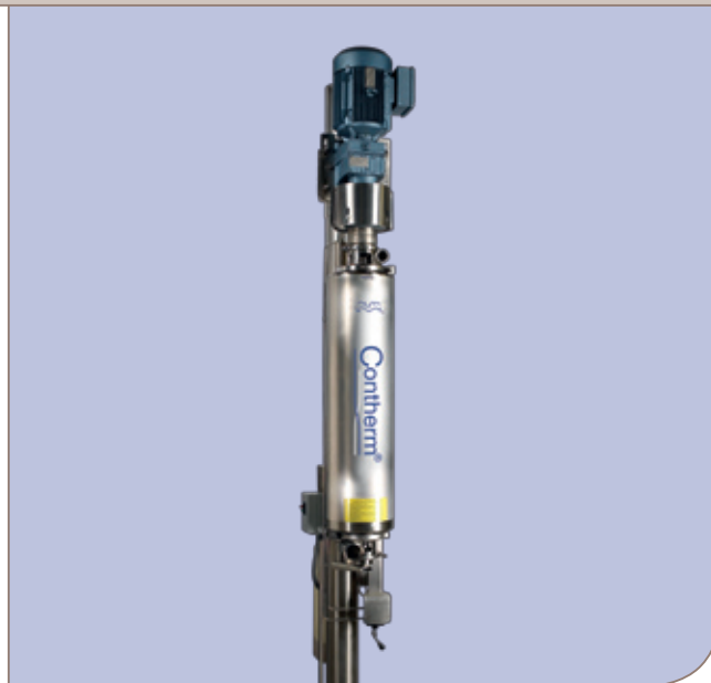
Contherm SSHE model 6x6

Product enters the cylinder through the lower product head and flows upwards through the cylinder. At the same time, the heating/cooling media travels in counter-current flow through the narrow annular channel between the heat transfer wall and the insulated jacket.