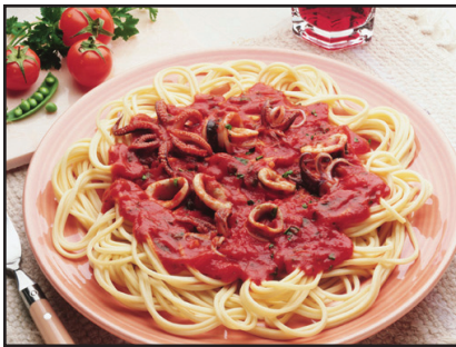
Tomato sauce with particulates

In the food industry, a number of products include ingredients that are susceptible to degradation due to shear or mechanical manipulation