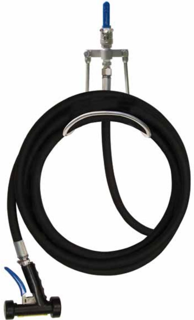
Shown: M-120 Wall-Mounted Hose Station; shown with premium hose assembly and S-70 Series nozzle.

Please see reverse side for parts listing.