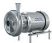
Alfa Laval LKH Evap