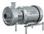
Alfa Laval LKHHPF