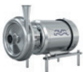
Alfa Laval LKH