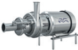
Alfa Laval LKH Prime

Alfa Laval LKH Prime UltraPure is available with Alfa Laval Q-doc, our comprehensive documentation package meeting the standards required for the pharmaceutical industry.