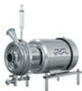
Alfa Laval LKH UltraPure