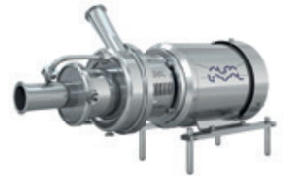
Alfa Laval LKH Prime UltraPure

The latest in Alfa Laval's premium range of best-selling hygienic centrifugal pumps.