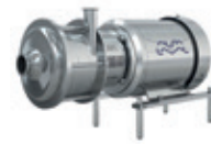
Alfa Laval LKH Multistage