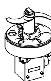
SINGLE CUP WITH CHOPPERS