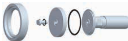
HD 100 device, reversible wear parts for double lifetime.

All Tetra Pak Homogenizers have a unique five-year warranty against pump block cracks. This warranty is possible thanks to the design of the pump block and to the extra durable stainless steel material.