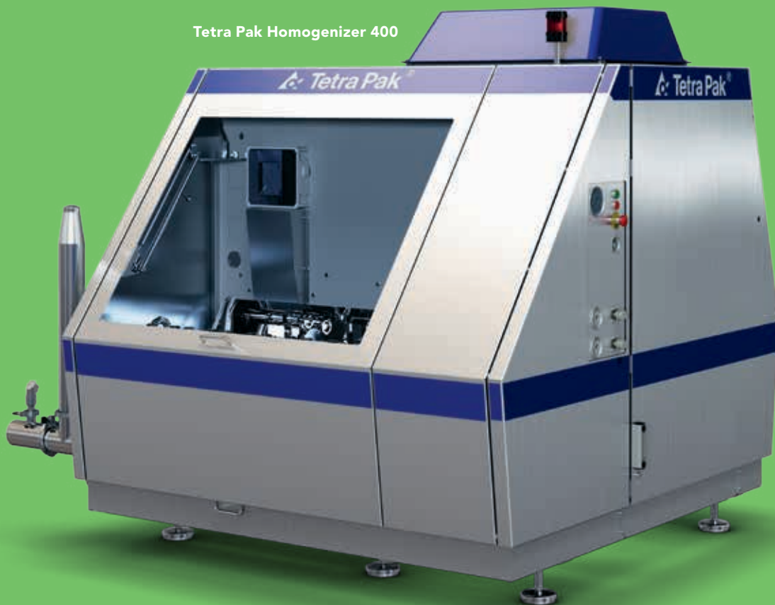
Tetra Pak Homogenizer 400

The Tetra Pak® Homogenizers combine high performance with cost efficiency and low environmental impact. We call it sound performance.